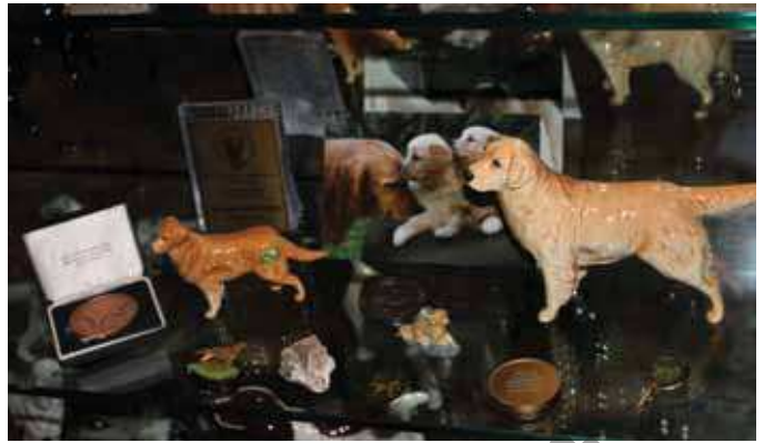
A miscellaneous collection of Golden Retriever memorabilia.