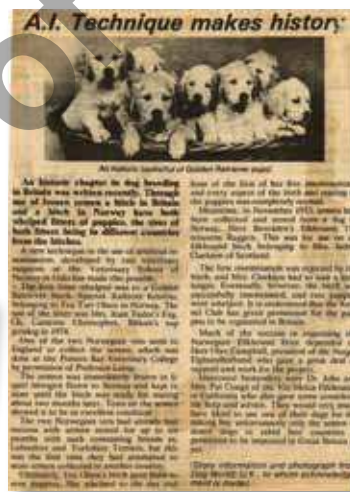
Article about a history making AI litter by Eng Ch Camrose Cabus Christopher in Norway.