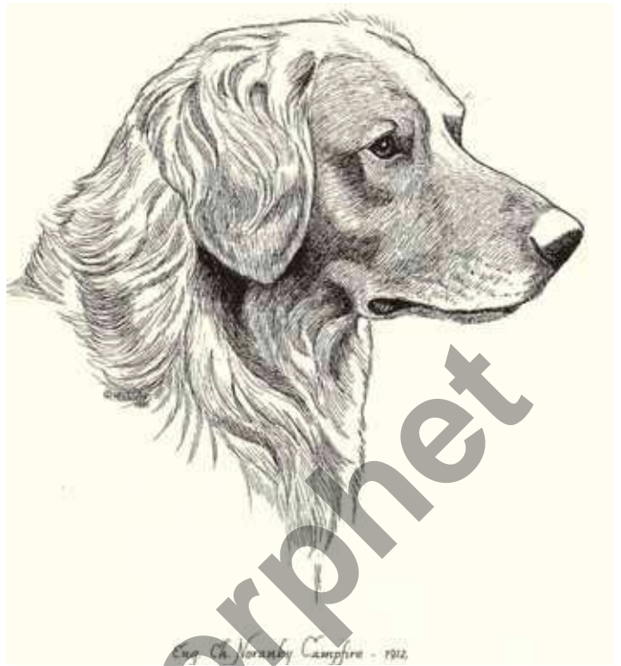
Eng Ch Noranby Campfire.