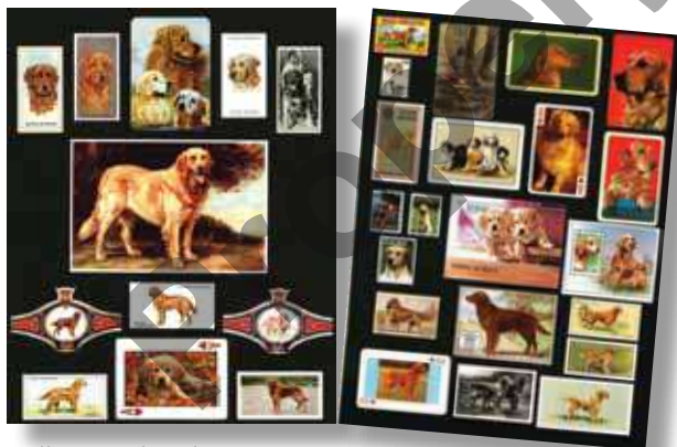
Collector cards and stamps.