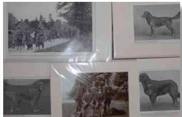
Matted papers purchased on ebay.