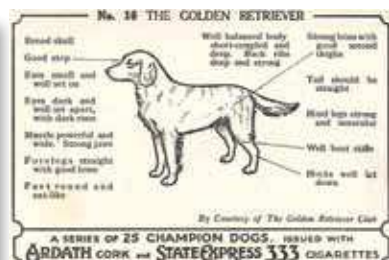
Cigarette Card - 1934.