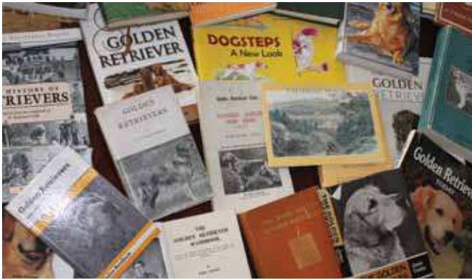
A collection of books relevant to Golden Retrievers.