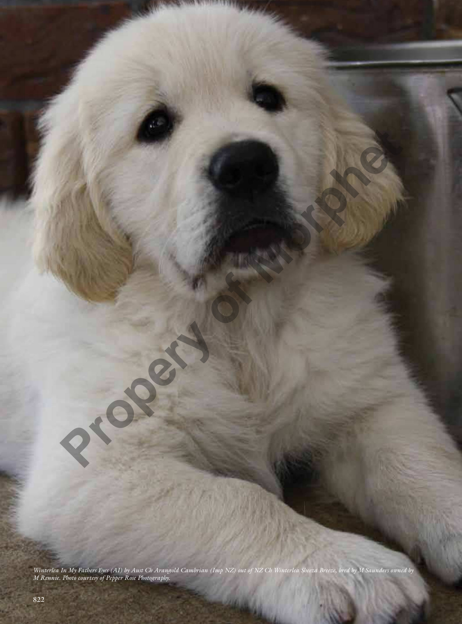
Winterlea In My Fathers Eyes (AI) by Aust Ch Arangold Cambrian (Imp NZ) out of NZ Ch Winterlea Sheeza Breeze, bred by M Saunders owned by M Rennie.