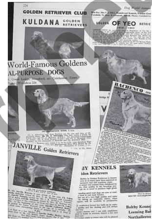
Golden Retriever Journal articles from the 1960s